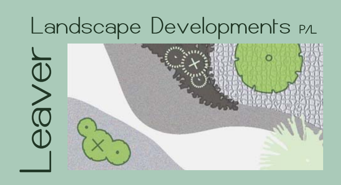
LEAVER Landscape Developments p/L